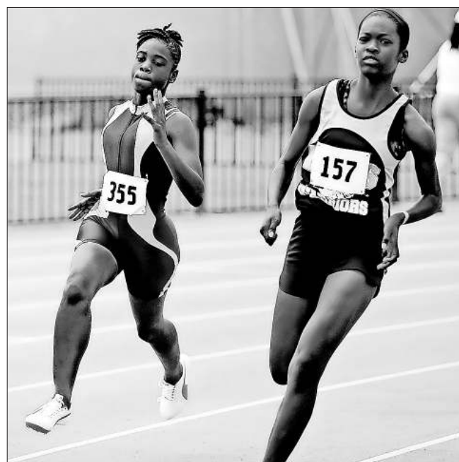
ON TRACK: Students from across the Bahamas compete in the National High School Track and Field Championships yesterday at the Thomas A Robinson Stadium.