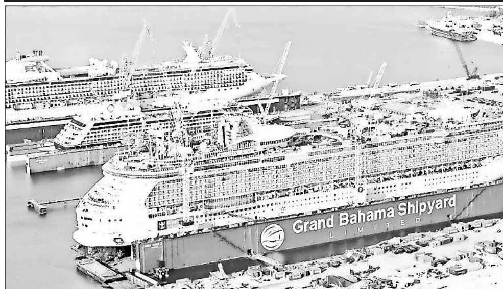
GRAND BAHAMA SHIPYARD